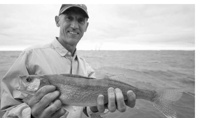
Upper Peninsula anglers are gearing up for this season's walleye, northern pike and muskellunge openers.

Michigan's current Fishing Guide (2016-2017) always is available online, as are the Inland Trout & Salmon Maps. View or download it at michigan.gov/fishingguide.